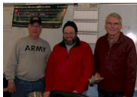
Pictured from left to right: