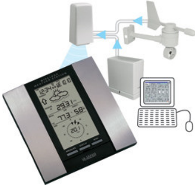
LaCrosse WS2315 model www.lacrossetechnology.com