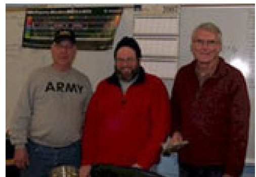
Pictured from left to right: