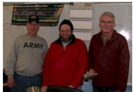
Pictured from left to right: