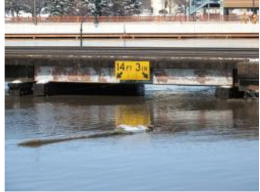
The Red River, the natural boundary separating North Dakota and Minnesota, rose to almost 41 feet at the height of the flooding.

At this time we have been relieved of duty at the Coast Guard (West Fargo PD) and the Innovis Hospital. It appears they now have a direct link and we are not necessary. I believe that this now leaves us only needing to staff 4 locations -- Cass and Clay County EOCs, the Red Cross and the Salvation Army. We are being told that the Salvation Army is moving to