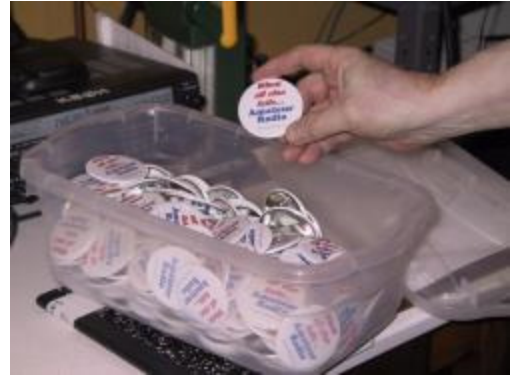
The promotional buttons for our ARES group. It seems that everyone has one.

Article from: http://www.arrl.org/news/features/2009/07/05/10940/