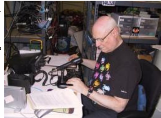
I'm one of five Net Controllers, but as Net Manager, I need to come up with a question for every week.

Assistant Emergency Coordinator -- 1, Certified Examiner -- 2, Certified Instructor -- 5, Certified Mentor -- 1, Emergency Coordinator -- 1, Technical Specialist -- 1, Official Relay Station -- 1, Volunteer Examiner -- 7