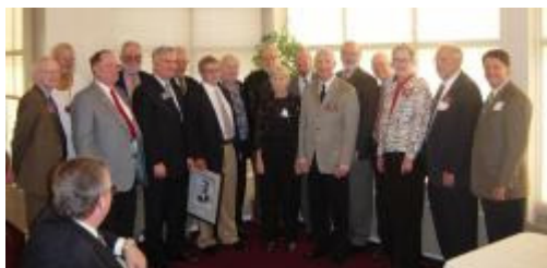
Three new members were welcomed to the ARRL's Maxim Society at the donor reception.

This elite group embodies the spirit of ARRL co-founder Hiram Percy Maxim, W1AW, who, in 1914, envisioned an organization dedicated to encouraging and developing Amateur Radio as a source of enjoyment for radio operators and as a public service to communities nationwide. Maxim Society donors nurture the legacy and leadership exhibited by "The Old Man" so many years ago. Their infectious enthusiasm and deep commitment to Amateur Radio and ARRL are evidence of their abiding loyalty. Their willingness to contribute generously to the work of ARRL is evidence of a remarkable dedication to the vision of Hiram Percy Maxim.