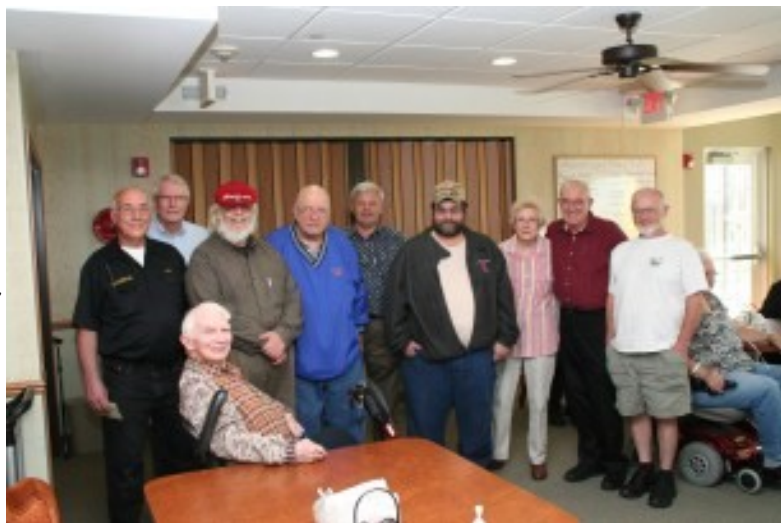
The Birthday Party attendees from WOSV.